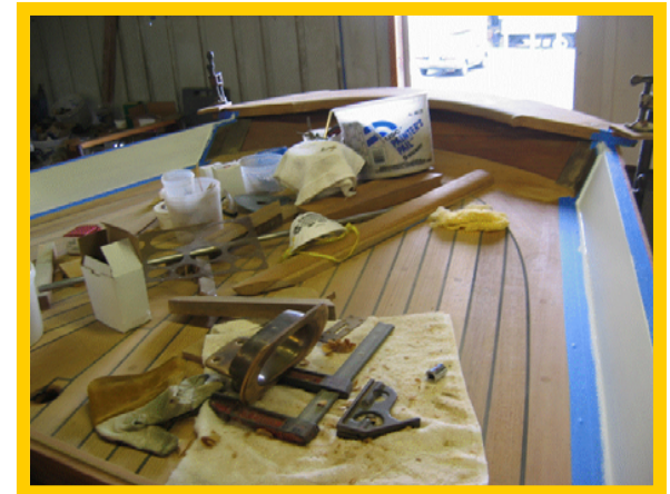
PACIFICA (2005): New deck, deck beams, and transom.