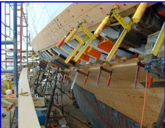
MIRAMAR (2001): Re-planked from waterline line down

Some projects shown in this brochure were managed through Clark Custom Boats.